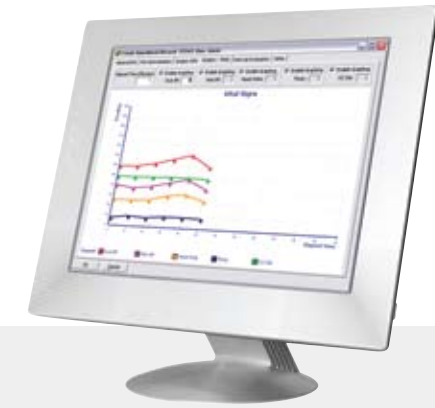
Anesthesia Records Module