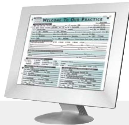
TRUFORM Software Integration Module

Digital forms are attached directly to the patient record within WinOMS CS software, allowing for streamlined office flow and centralized patient information.