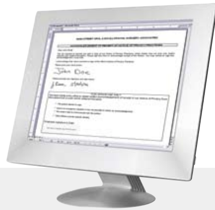
Digital Forms Module