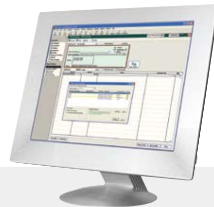
QUICKBOOKS Software Integration Module

If an electronically pre-registered patient already exists in your software (as a patient or a walk-in), WinOMS CS software finds the patient and prevents a duplicate record from being created in your database.